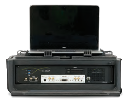
RP-6120P Capture real-world RF wherever you are.

Accelerate your RF product designs and research projects with the powerful and cost-effective RP-6100 — a state-of-the-art RF recorder solution.